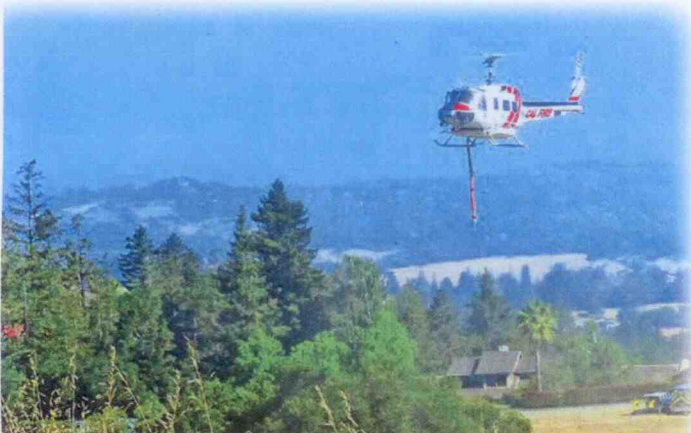
Photos on this page show the Santa Clara County Fire Training exercise that was held on June 26. The helicopter and triage were utilized in simulation of wildland fire suppression.