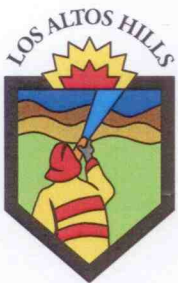
COUNTY FIRE DISTRICT

The jurisdictional population is currently about 13,000 residents. Financing for the services is provided through allocation of the county property taxes provided by the Santa Clara County Board of Supervisors. Any unused fund balance may be used for special projects such as fire hydrant upgrades, pipeline improvements and for fuel reduction programs such as tree abatement and emergency preparedness programs.