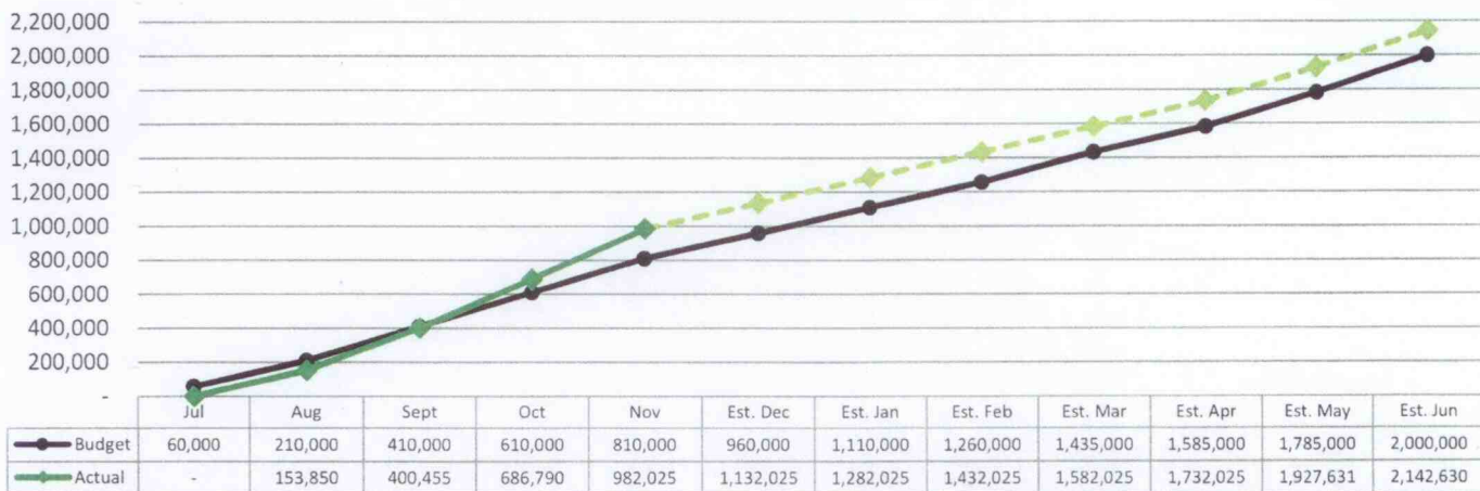
Budget vs. Actual Cumulative

Note 1: Dashed lines represent estimates