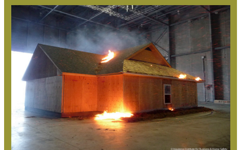
Photo 2. In order to be effective, external sprinklers must be able to wet all areas where ignition can occur, or be sufficiently effective in quenching embers that approach the home so they won't have enough energy to ignite combustible items.