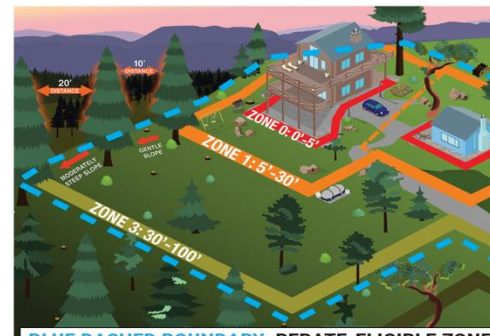
BLUE DASHED BOUNDARY: REBATE-ELIGIBLE ZONE

PLEASE NOTE: Improvements must be within the 100-ft defensible space zone and completed by a licensed contractor to be eligible for the rebate. Tree removal and some exclusions do not qualify for a rebate. Please read the Program Advisory on the registration page for further details.